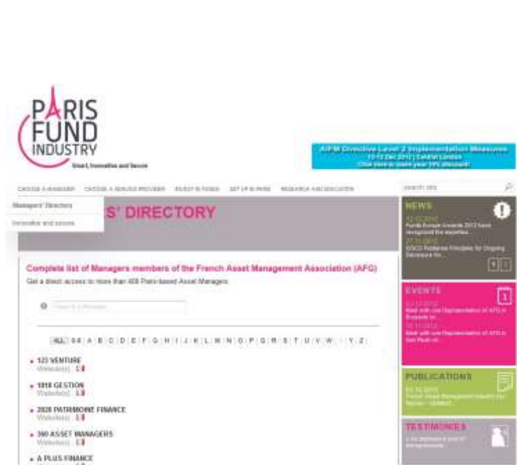
Copie d'écran de la rubrique « Choose a Manager »